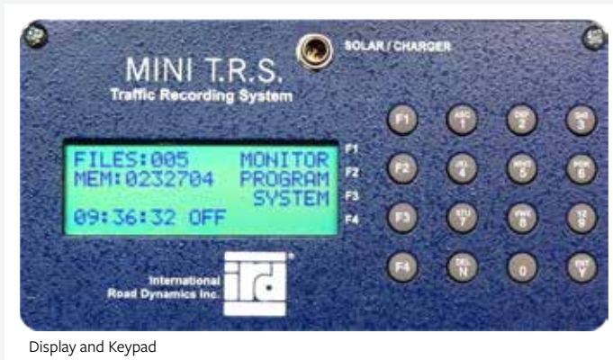
Display and Keypad