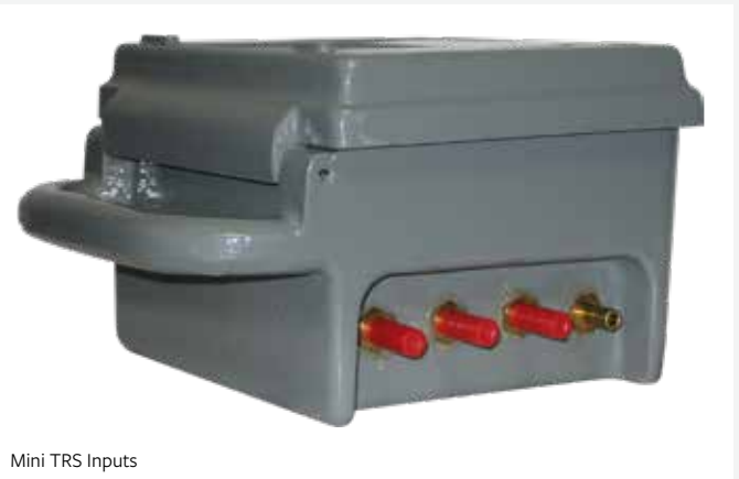
Mini TRS Inputs

IRD's Mini TRS Plus is a durable, reliable, counter/classifier that is built for extended field use. The cast aluminum enclosure is weatherproof and provides excellent protection for the electronics and your data. IRD's Mini TRS Plus has a long-life battery, and is also available with a solar panel charger for performing longer-term studies without recharging.