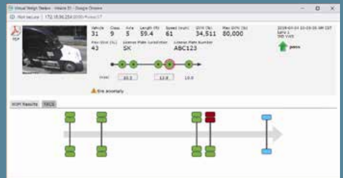
VWS vehicle record: position of tire anomaly is indicated on axles