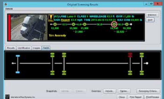
TACS integrates with IRD's operator display to identify tire problems