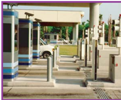
DYNAX® 4 Strip treadle

The DYNAX® sensors are pressure sensitive and are unaffected by speed variations, making them ideal for stop-and-go traffic conditions. Combined with other sensors and systems, DYNAX® sensors can be used to detect and classify vehicles. Standard DYNAX® sensors or Single/Dual DYNAX® sensors may be used in the treadles. Standard sensors detect axles, while Single/Dual sensors can detect number of tires per axle.