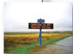
VMS-VARIABLE MESSAGE SIGN

Monitor Multiple Weigh Stations From a Central Location Independent - Remote Station Operation!