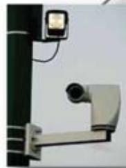
PTZ-PAN TILT ZOOM CAMERA