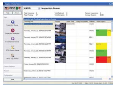
6. Inspection Management