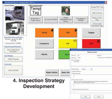
4. Inspection Strategy Development