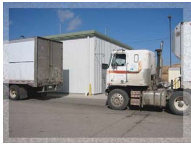
5. Inspection Facility