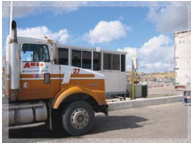
3. Primary Point of Inspection Facility