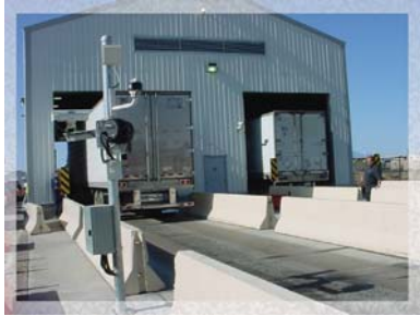
1. Automated Pre-Screening Facilities