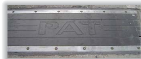
IRD PAT Traffic Bending Plate

IRD HAS SUPPLIED OVER 3000 LANES OF WIM@Toll WORLDWIDE.