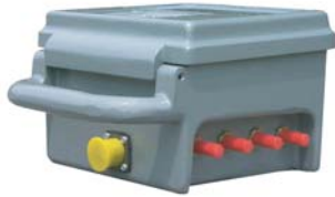
Mini TRS Inputs

The TRS can be operated via the integrated keypad and display or via a serial link with a computer or modem. Upon power up, the TRS is completely menu driven for ease of use in the field. To serve the special needs of many different users, the TRS options include: solar panel, pcmcia interface, expandable memory, environmental sensors and WIM.