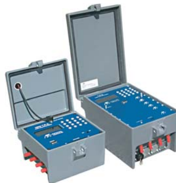
Mini TRS and TRS