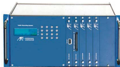
TRS Rack II

The TRS product line offers superior data collection capability and flexibility. The standard display is a four line by twenty character LCD. The 16 alphanumeric keys allow the user the option to program the unit without the use of a computer. Depending on the application, the unit can be packaged in three different housings and may be used portably or permanently. Data can be downloaded from the site without interrupting the data collection process.