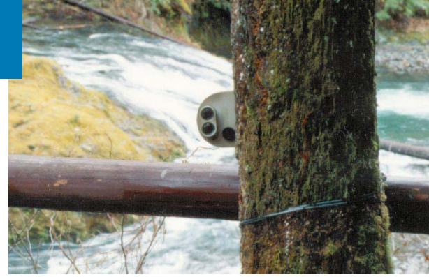
For photographic purposes, the counter has been mounted to be visible. Normally the counter would be hidden by the tree.

The new Millennium Trail Traffic Counter is a portable, battery powered instrument for counting trail traffic in remote areas.