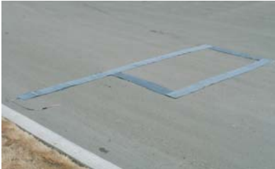
MODEL 8064 QUICK STICK LOOP