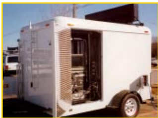
Roadside Trailer supplied for NOMAD project

In a related CVISN pilot project, IRD has worked closely with Virginia DOT to supply components of the NOMAD system for testing the concept of a mobile sorting, weighing and inspection system. The NOMAD concept provides the ability to screen vehicles on the mainline based on weight and dimension compliance and credential checking. Vehicles likely to be safety, weight, or credential violators are selected from the traffic stream and directed to a temporary enforcement area. The system can be easily and rapidly deployed on secondary roads lacking regular enforcement facilities to improve safety and reduce pavement damage on these roads.