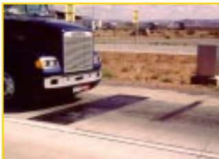
IRD Weigh-in-Motion System

IRD has helped implement the first deployment of CVISN for prescreening of vehicles at a weigh station as a pilot project for Virginia DOT. The Stephens City weigh station was upgraded by IRD from a traditional ramp sorter using Weigh-in-Motion (WIM) technology, to include credential sorting based on the CVISN program. The IRD supplied system is integrated with the CVISN Roadside Operations Computer (ROC) to receive regular updates to the vehicle safety and credential information.