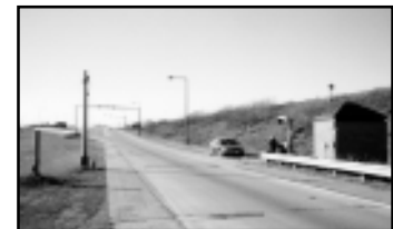
St. Croix POE Ramp Sorter System

In Minnesota, IRD is working as a participant in the development of the Statewide CVISN system. IRD will implement all equipment and functions occurring at the weigh station level, including the development and supply of the Roadside Screening System. The Roadside Screening System will communicate with the CVIEW system, being developed by the project team, to obtain and provide updated vehicle snapshots. IRD will be implementing upgrades at the St. Croix POE to use CVISN information as part of the decision making criteria.